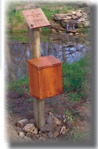
Nature Discovery Trail: Take a 12 station journey, learning about wildflowers, tree growth or pond creatures.