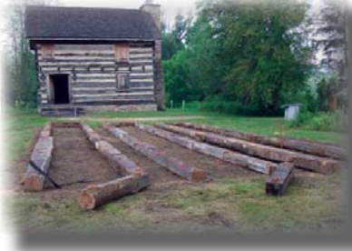
Colonial Garden: In progress at the Lochry Blockhouse - A representation of 1800's gardening.