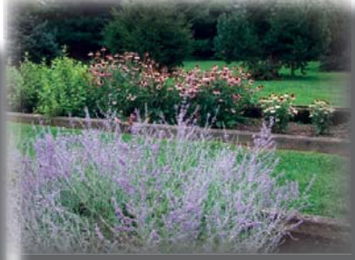
Pollinator Garden: Located at the Monastic Garden, learn what plants attract nature's butterflies and bees.