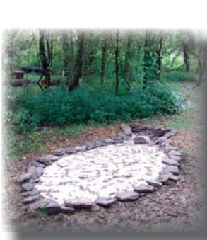
Pond and Natural Play Area: Explore aquatic life or sit for a quiet moment, or build with natural materials.

As the Nature Reserve continues to grow a landscape for discovery, play, relaxation and learning, keep your eyes open for special spaces for families and friends to meet and experience nature.