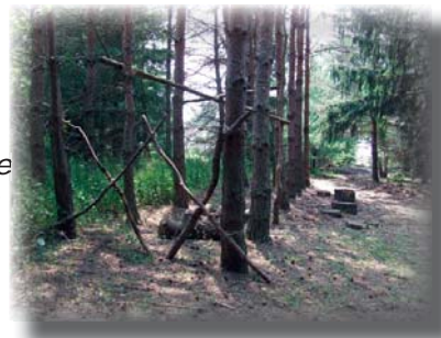
Childrens Natural Playground: Tucked in the pines, near the Monastic Gardens, take a swing, balance or hide.

In an effort to keep you more informed, find us on Facebook and you will receive news and updates from the reserve about new programs and events.